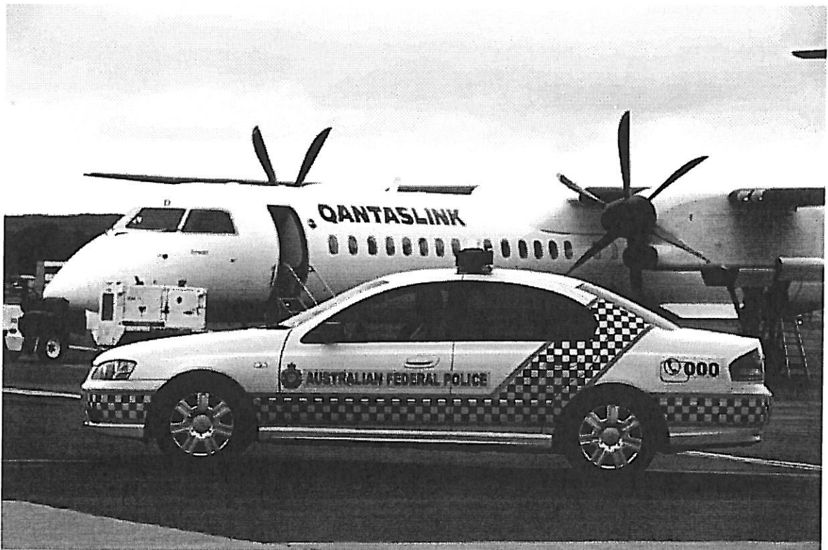
AFP Aviation Vehicle