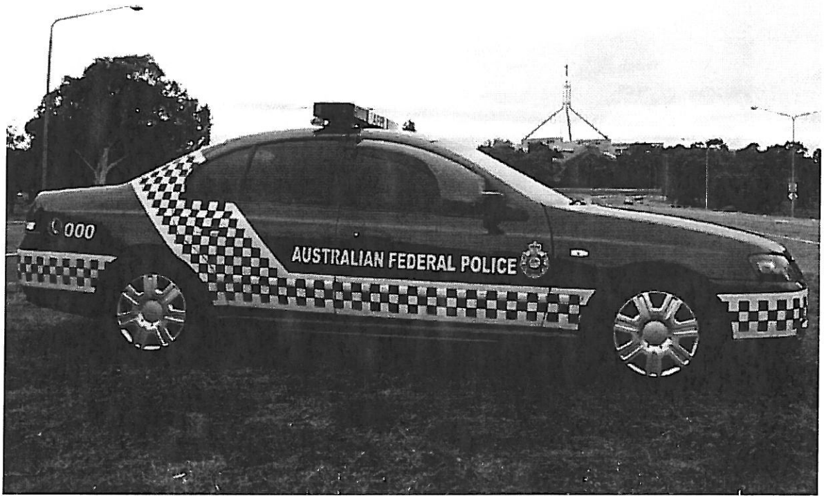
AFP Protection Vehicle